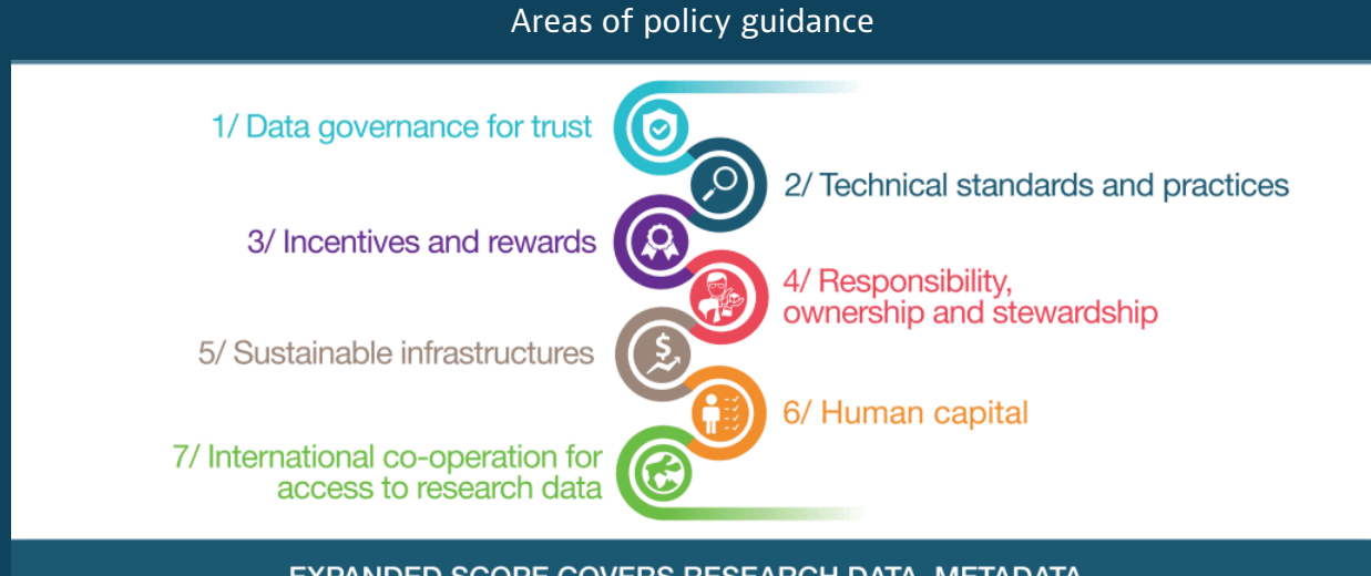
Figure 2. OECD's Recommendation concerning Access to Research Data from Public Funding

The revised Recommendation expands its scope to cover not only research data, but also related metadata (data about data, specifying their sources, methodology and limitations), as well as the bespoke algorithms, workflows, models and software (including code) that are essential for their interpretation.